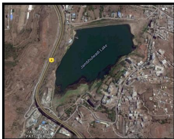
Fig. 1 Jambhulwadi Lake Location